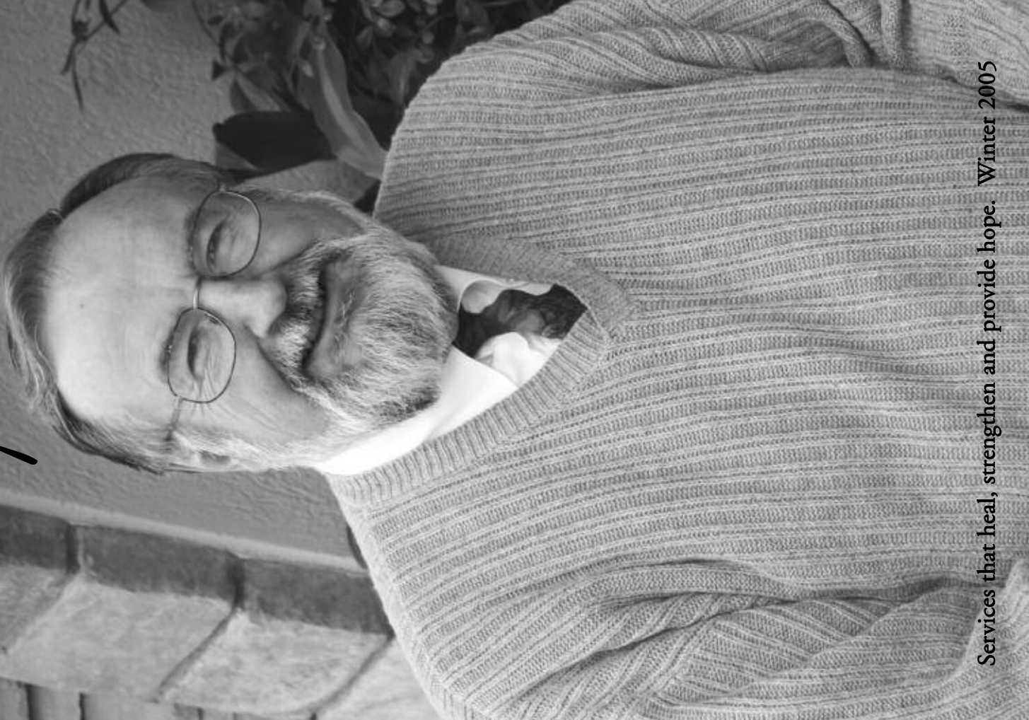
Services that heal, strengthen and provide hope. Winter 2005